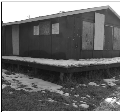
The Levack ski chalet is now gone but the hill is in great shape and is one of the best tobogganing areas in Sudbury.

Prizes for Oldest, Youngest, Most Creative, Fastest, Slowest, Most People on a Toboggan (Cardboard and Regular toboggan categories)