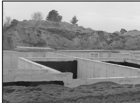
New foundations in Levack, Kastletree Homes starts construction