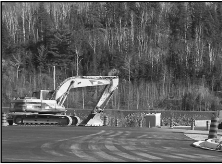
Work on the Levack/ Onaping Water Line