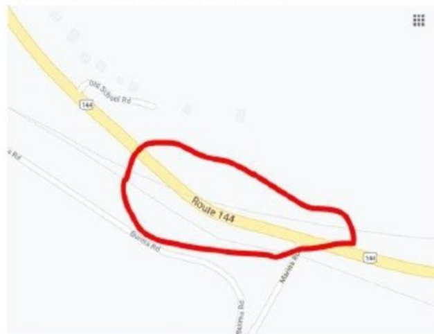
France Gélinas MPP for Nickel Belt

Constituency Office / Bureau communautaire