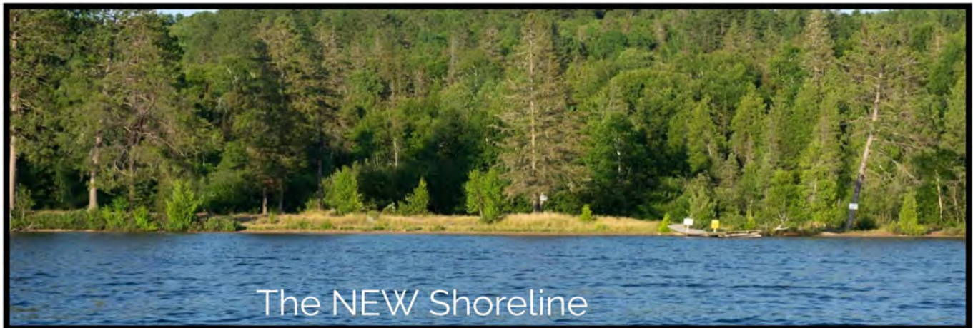
The NEW Shoreline