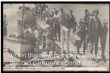
When the new campers arrive the old campers sit and stare.