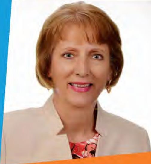
France Gélinas MPP Nickel Belt