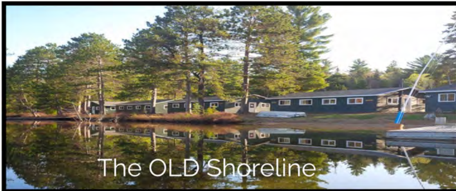
The OLD Shoreline