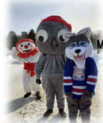
Mascots - Bonhomme, Ookpik and Coady