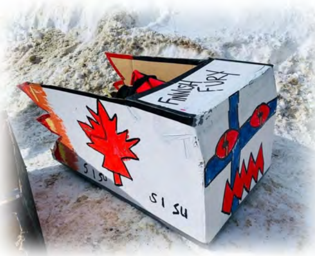
The Finnish Fury ran a good race in the Derby!!